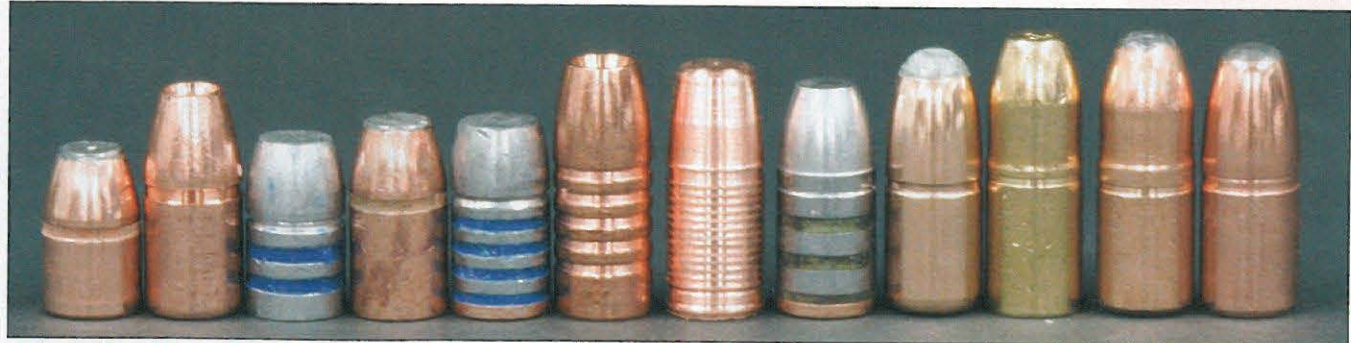
A broad variety of .475-inch bullets was tested and/or modified to produce optimum performance in heavy game. This lineup includes samples from 350-grain pistol bullets to 500-grain solids.

The standard lever on the Model 1886 Winchester was lengthened somewhat to facilitate handling.