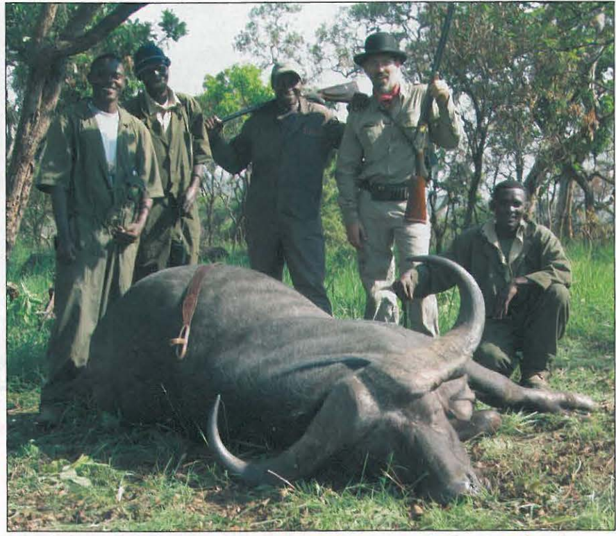
The fight with this Cape buffalo started at 70 yards, but it refused to stay down until it received a 420-grain Barnes bullet between the eyes at 15 paces.

Doug is offering properly headstamped cases (to avoid problems in foreign countries) along with Hornady or RCBS reloading dies and Barnes TSX bullets in standard weights. The folks at Turnbull Restoration can build a Model 86 or 71 (takedown or standard receiver) on a rifle they